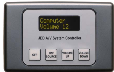
T40R with metallic keyboard.

Dual RS232 serial ports, RS485 port: Serial port one drives the main display device, with Tx and Rx lines (and an optional CTS line). The Rx input receives and processes data from the display device, such as On/Off status, volume, lamp and filter hours, error states, alarms and internal temperatures (which can be reported via the networking option.) Serial port two drives ancillary devices, such as the JED T461 four-channel switcher/mixer, and the JED T464 networking adapter. (The T461 changes audio channels in step with the video channels, and provides absolute volume control for four stereo pairs to a stereo line out.)