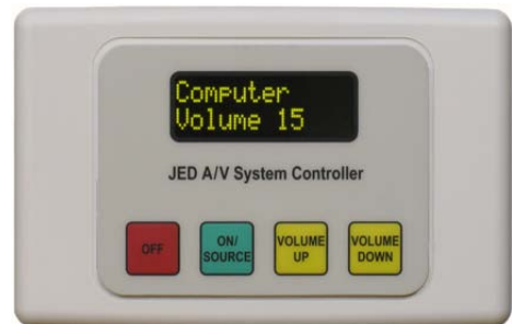
T460R with Beige keyboard.