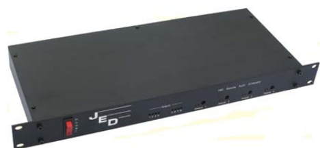
T461 four-channel audio mixer/attenuator with eight relays.